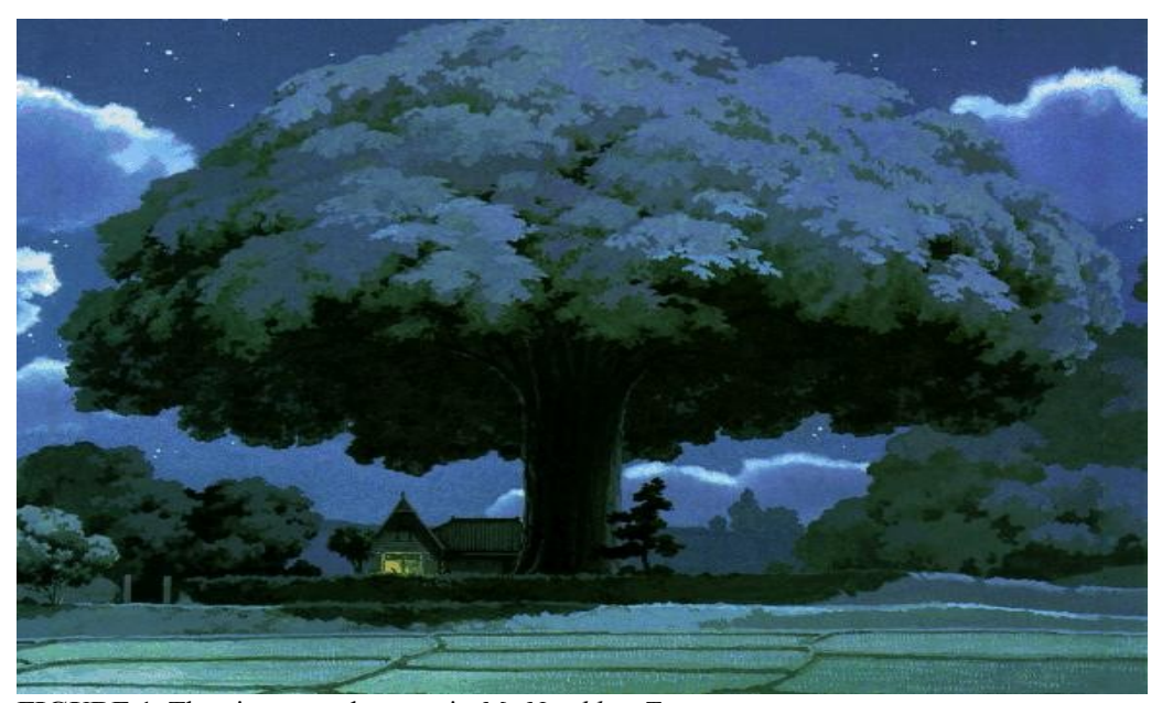
FIGURE 1. The giant camphor tree in My Neighbor Totoro .

That is, although I did not grow up in the Japanese countryside, I do not think I am alone in feeling Platonic eros or Ottonian numinous when, in Totoro , I am presented with images of rice fields in the country, the two girls watching a leaf floating down a stream, a torii in the forest, the country house surrounded by overgrown grass and butterflies, the humming of the cicadas, and, most especially, the mysterious old camphor tree – a kami or god who has existed from the days of yore, "back when trees and humans used to be friends." All of these images – but especially the archetypal tree – resonate the divine, not because they remind me of my youth, but because they embody and reflect something spiritual. But, some may ask, is this not simply Shinto spirituality, in which "the material never exists without some relation to the spiritual"? While I question the philosophical soundness of Shintoism, its insistence that "the world is kami -filled" is a perfect metaphor to express how all things can potentially arouse spiritual longing – how, on my account, most things have the dust of the divine and yet are not themselves the divine.